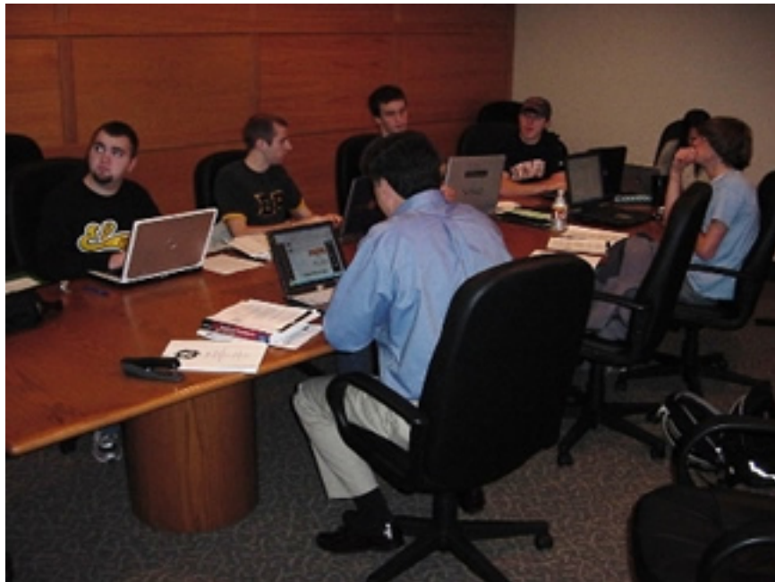
Weekly Investment Team Meeting